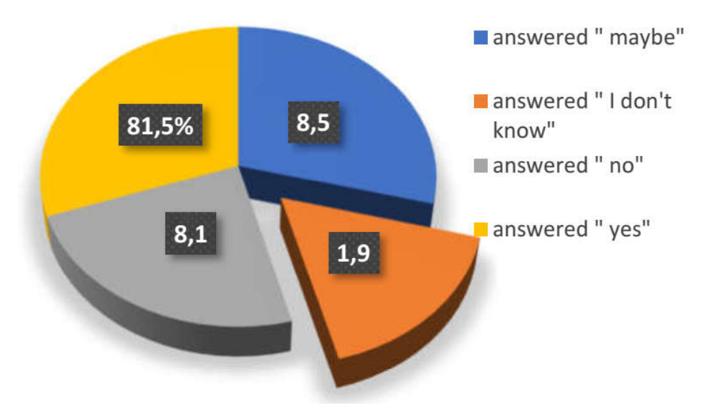
Figure 2. Lockdown: deviant behaviors that influence the contagion from Covid19 in Romania. The data from 735 participants

For Romania, the dataset contains 735 individuals who answered the questions proposed in the Questionnaire. Among the most significant data it emerges that with regard to the age group, 52.5% is included between 15 and 25 years of age; 22.4% between 26 and 35; 13.9% between 36 and 50; 11.2 over 50 years of age. The degree of education for 57.2% is a high school diploma, 17.9 a bachelor's degree, 11.8% a master's degree, 12.5% a college diploma, while remaining percentage the elementary school or other. With regard to the geographical position in Romania, 79% of the interviewees are resident in south Romania and 18.6% in the west, the remainder in the north and east. 55% said they were married, while the remaining 45% live together and/or are not married. In addition, 22.9% of respondents have children, while 77.1% said they have no children. With regard to the possibility that deviant behaviors (failure to use personal protective equipment, infringements of the various prohibitions imposed, conducts with a high risk of transmission of infections in the home, and so on) during the lockdown can cause contagion from Covid 19 (Figure 2), 81.5% answered with a firm "yes", 8.5% answered generically "maybe", 8.1% answered "no", and finally 1.9% answered "I do not know".