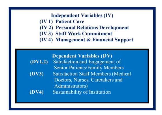
Figure 4.1: Conceptual Framework

Based on the theoretical framework philosophy of quality senior patient care, the body is related to physical strength of senior patients, the mind is related to the mentally strength of positive thinking as well as sustainable satisfaction/engagement and the soul and spirit are related to the spiritual development of unworried life, unattached to substances and living good life. These three aspects of body, mind and soul/spirit are interrelated the total human system as the whole system and developed to the conceptual framework. The development of physical, mental and soul/spirit are developed all together and have a substantial influence on the quality of senior care services. The conceptual framework as shown in Figure 4.1 had two layers. The inner layer had four dependent variables (DV) of satisfaction and engagement of senior patients/family members (DV1,2), satisfaction staff members (medical doctors, nurses, caretakers and administrators) (DV3), and sustainability of institution (DV4). The outer layer had four independent variables (IV) of patient care (IV1), personal relations development (IV2), staff work commitment (IV3), and management & financial support (IV4).