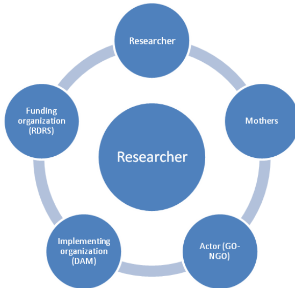
Figure 3: Five wheels expectation of the Researcher

language should not obscure understanding. Within this compass, this piece of research made a number of connotations, which were difficult to fill the gaps of qualitative research. As researchers, we found that there are five wheels where we need to satisfy them (Figure-3). These are researchers ourselves, direct beneficiaries (mothers), different actors (GO-NGO), implementing organization (DAM), and funding organization (RDRS). Everyone has their own freedom to see the facts and findings of the research. However, it was very difficult to satisfy all of them as the reliability and validity rigor of the research. One opponent came from the implementing organization is to produce positive report. On the other hand, the mothers appealed to add some recommendations within the report so that they get some income generation activities from DAM, which is a common expectation of the beneficiaries from the NGOs (Islam et al. 2005). The qualitative research cannot prove the performance level of the mothers and other actors accurately on how the safe motherhood was encountered and what were the gaps between the impact of monitoring and advocacy. In this circumstance, the researchers' position was so vulnerable that it was extremely hard-hitting to maintain the validity and reliability to all groups.